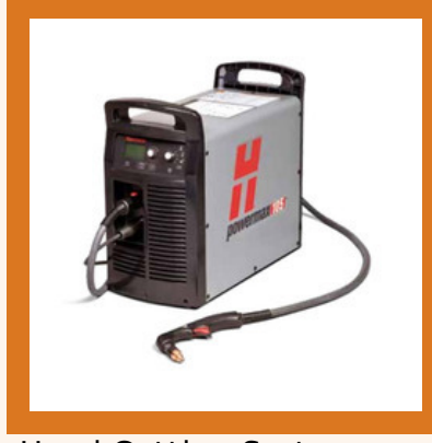
Hand Cutting System