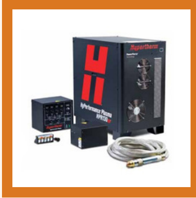
Plasma Cutting Machine