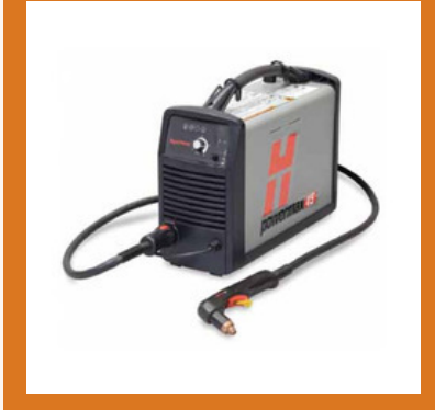
Hand Cutting System