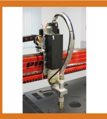
Plasma Cutting Head