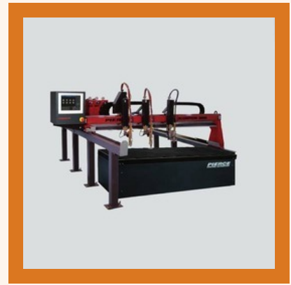
CNC Profile Cutting Machine