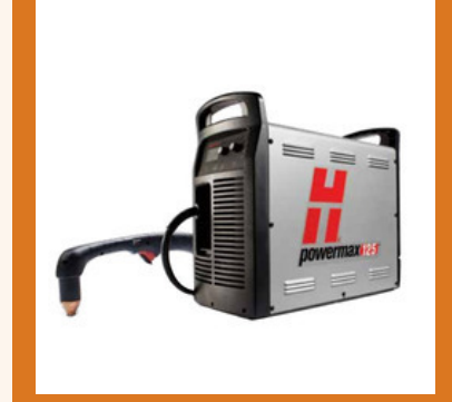
Hand Cutting System