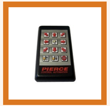
Remote Control Of Control System