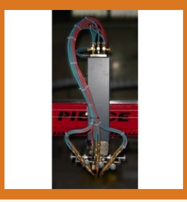
Oxy Tripple Torch Head For Straight Cut