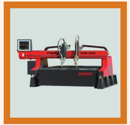
CNC Profile Cutting Machine