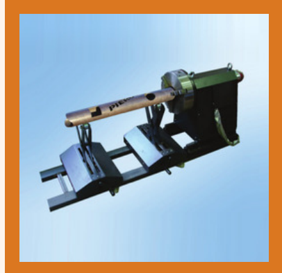
CNC Profile Cutting Machine