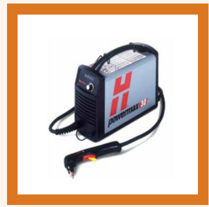
Hand Cutting System