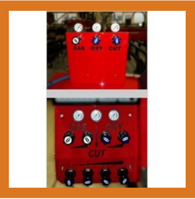
GAS Console with Manual Reduction Valve