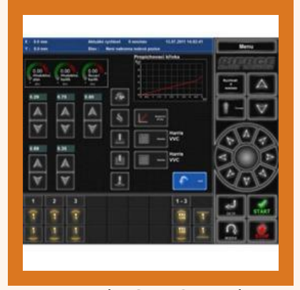
Automatic Gas Console