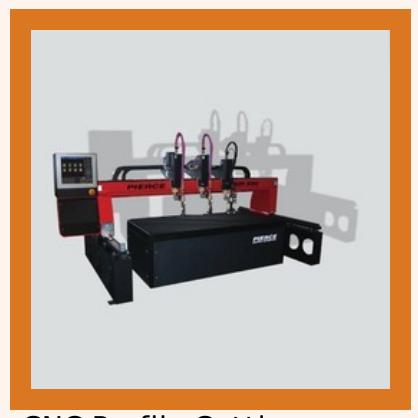
CNC Profile Cutting Machine