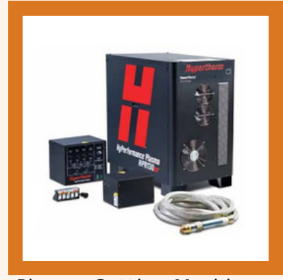
Plasma Cutting Machine