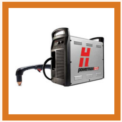
Plasma Cutting Machine