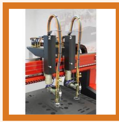
Oxy Cutting Head