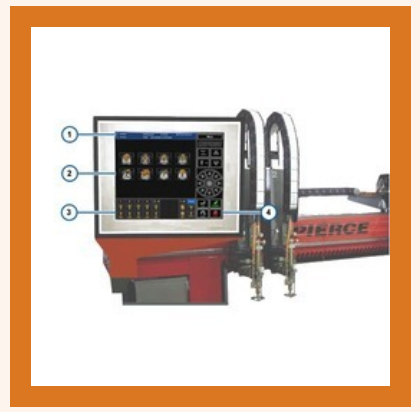
Control System of CNC Profile Cutting Machine