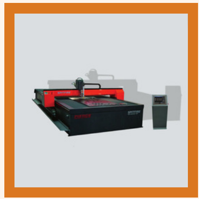
CNC Profile Cutting Machine