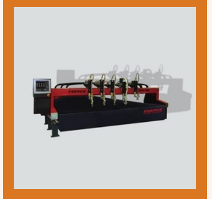
CNC Profile Cutting Machine